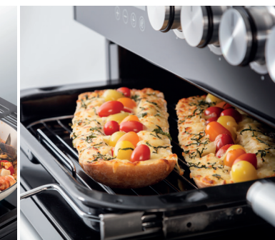
Deluxe glide-out grill