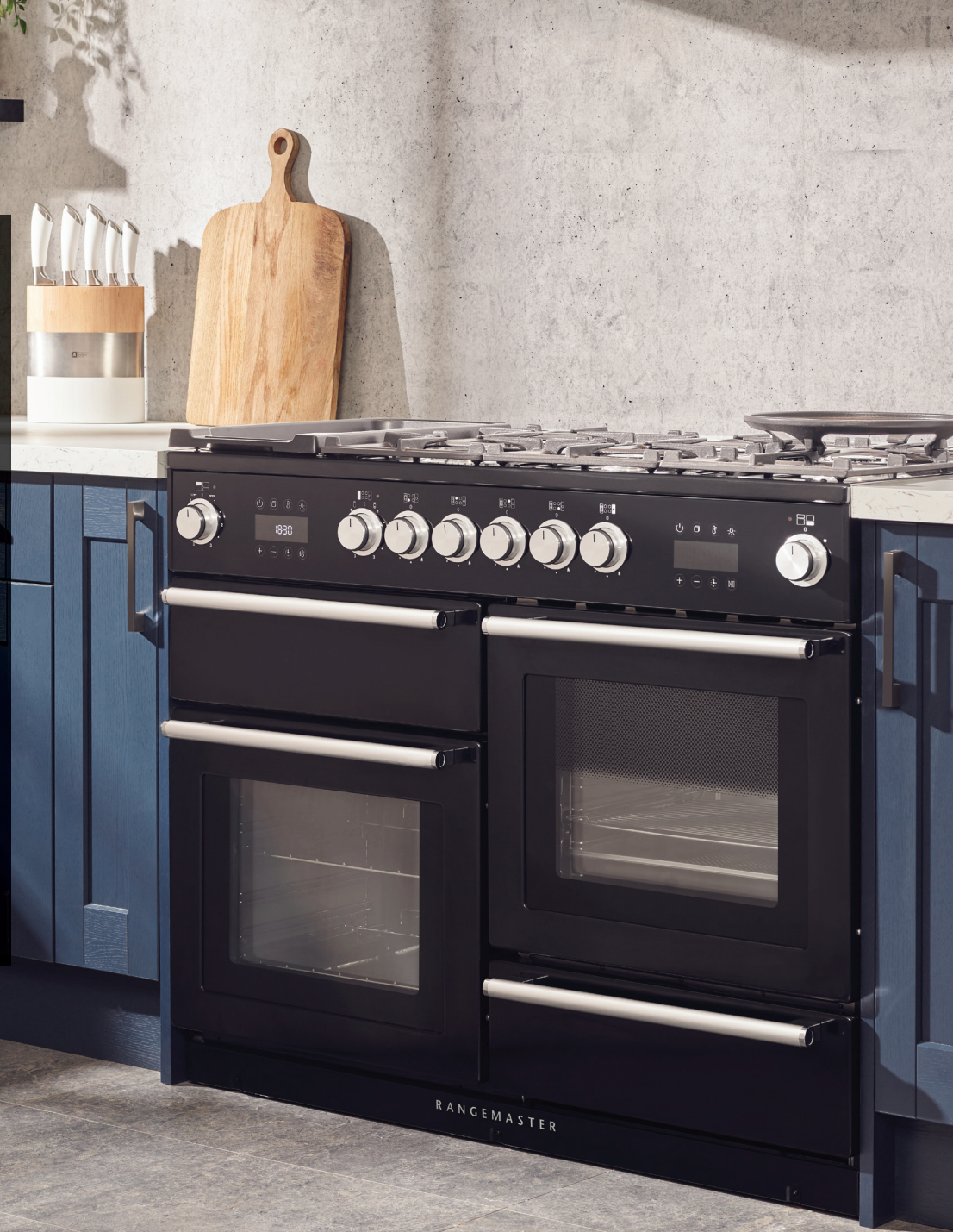
Rangemaster NEXUS Steam 110 Dual Fuel in Black