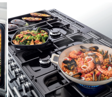
Deluxe gas hotplate