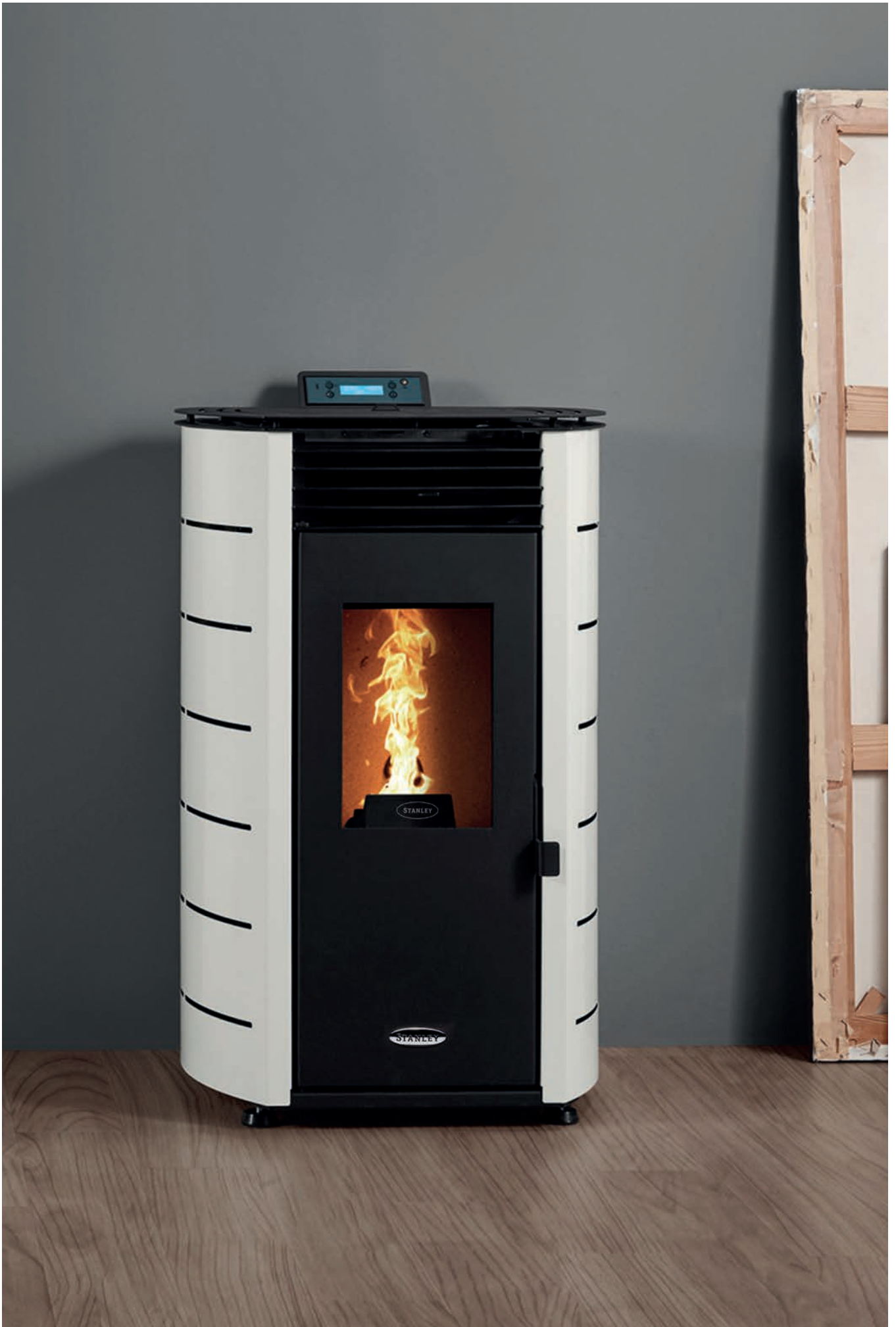
SOLIS K100 Curve White shown