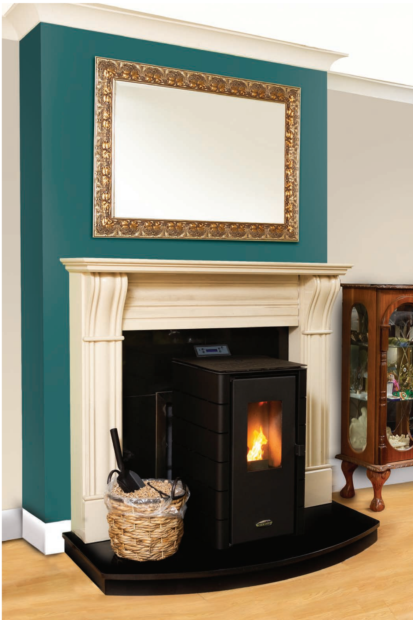
SOLIS K50 in Black shown