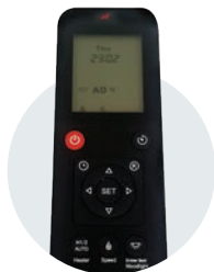
FULLY REMOTE CONTROLLED