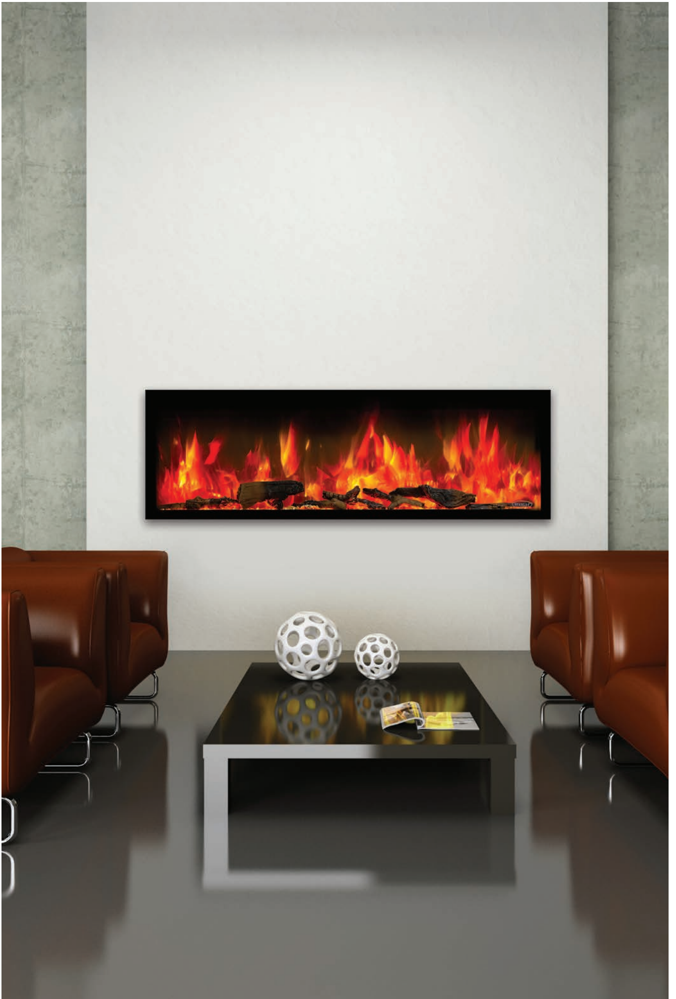
125cm Built In shown