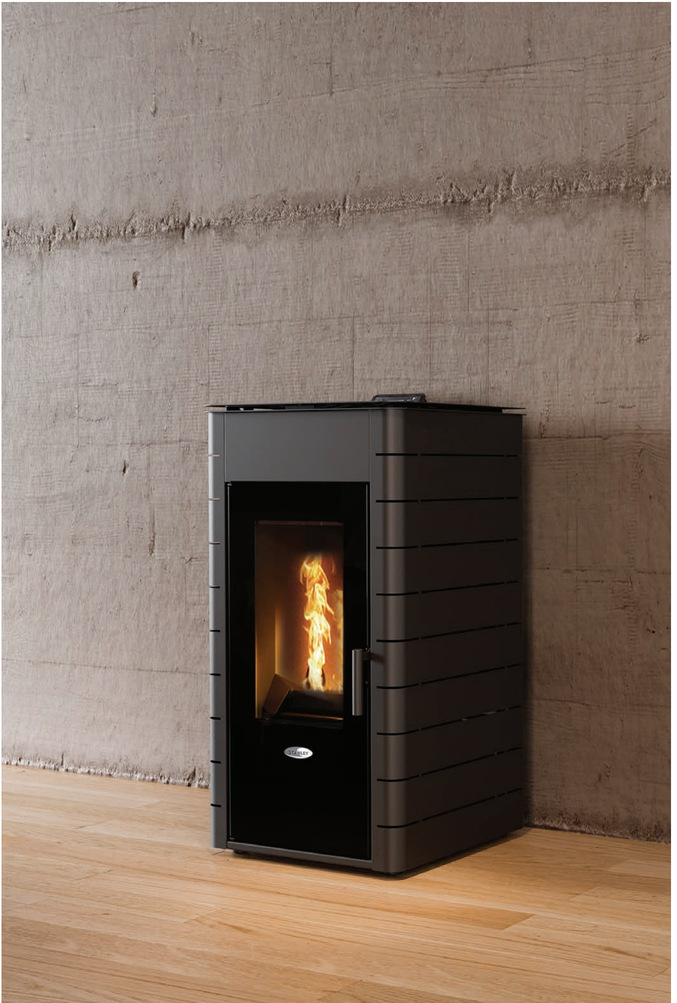
SOLIS K1700+ in Black shown