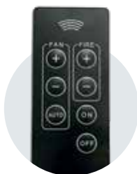
FULLY REMOTE CONTROLLED