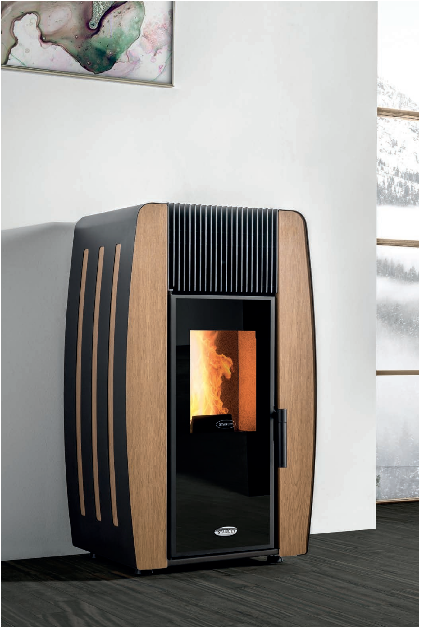
SOLIS K300 in Oak shown