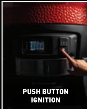
PUSH BUTTON IGNITION