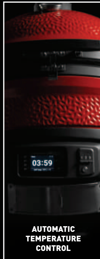
AUTOMATIC TEMPERATURE CONTROL