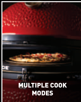
MULTIPLE COOK MODES