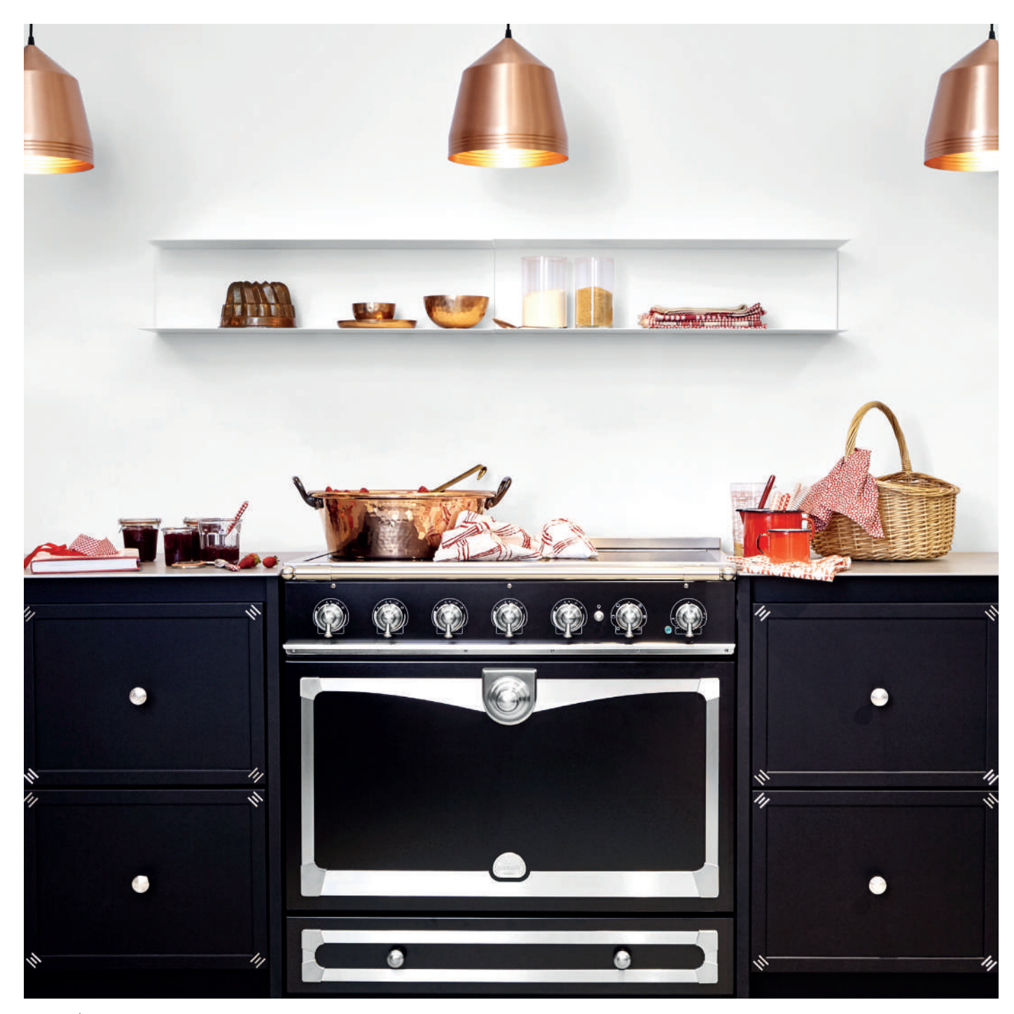
CORNUFÉ 110 INDUCTION in MATT BLACK with STAINLESS STEEL TRIM and POLISHED STAINLESS STEEL RAIL and POLISHED CHROME ACCENTS