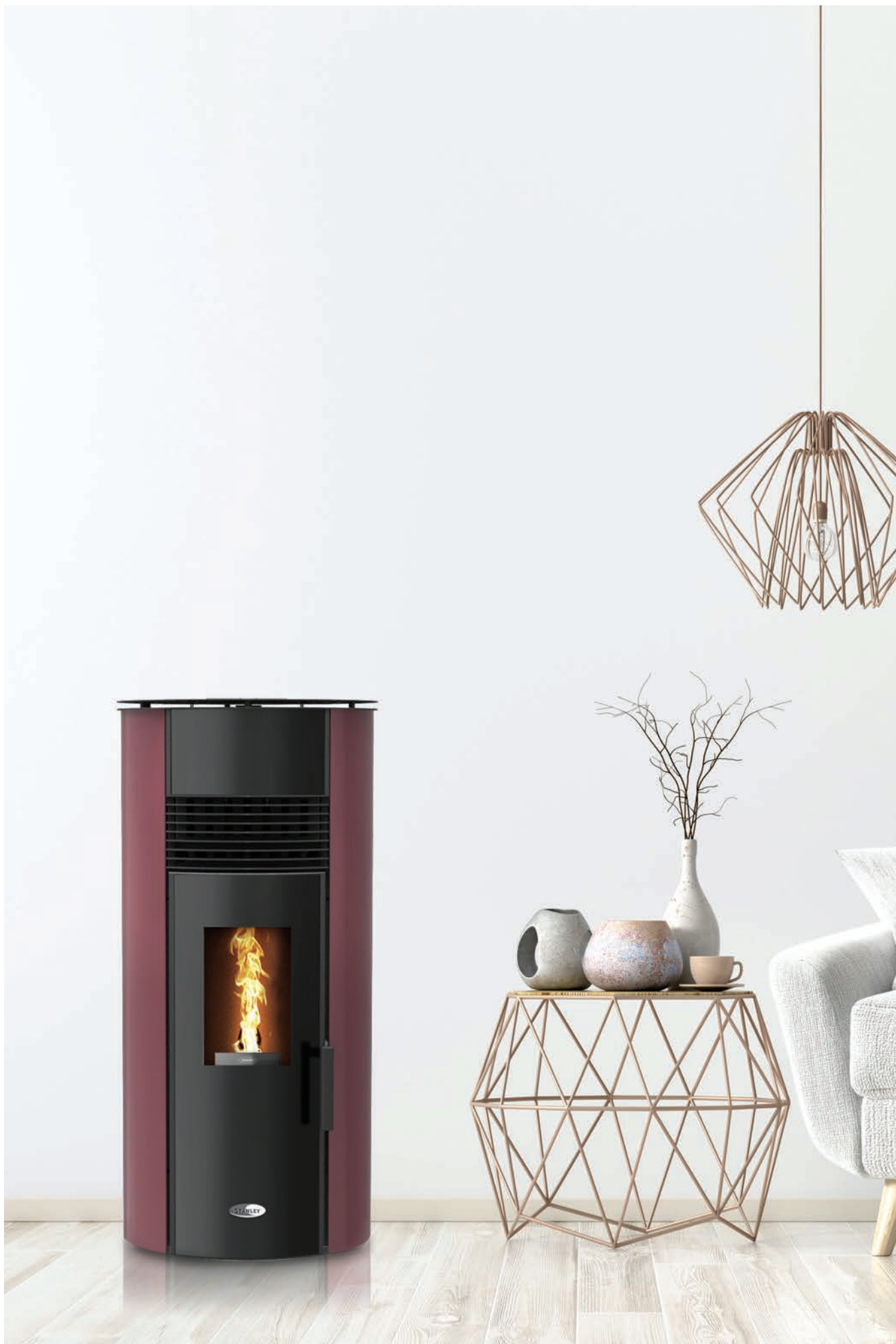
SOLIS K500 in Claret shown