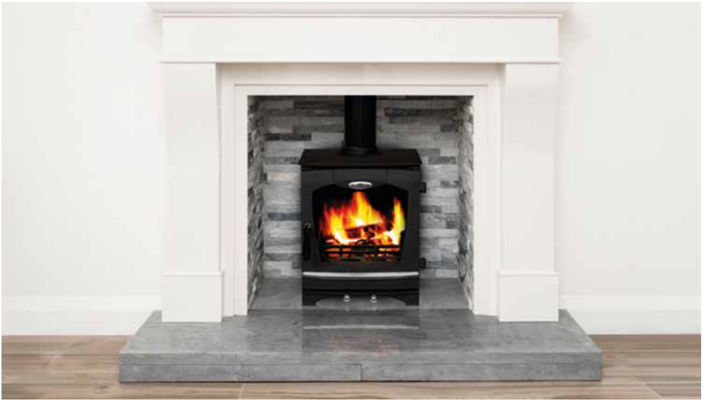
Stanley Allen Eco Stove