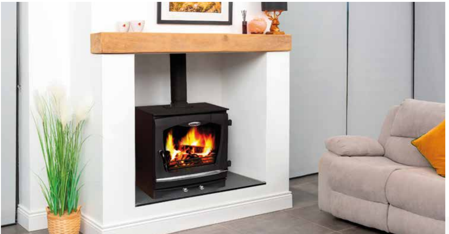
Stanley Corrib Eco Stove