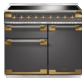
100cm *Induction only.