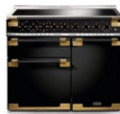
100cm *Induction only.