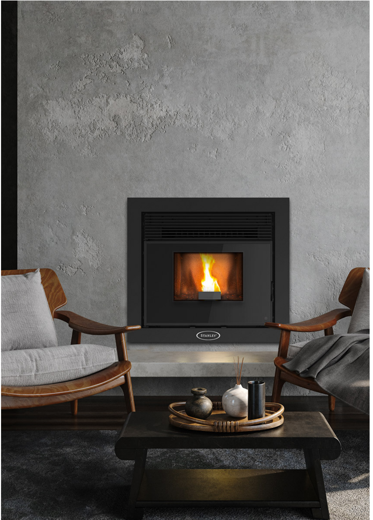
SOLIS IK900 shown