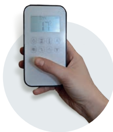
FULLY REMOTE CONTROLLED