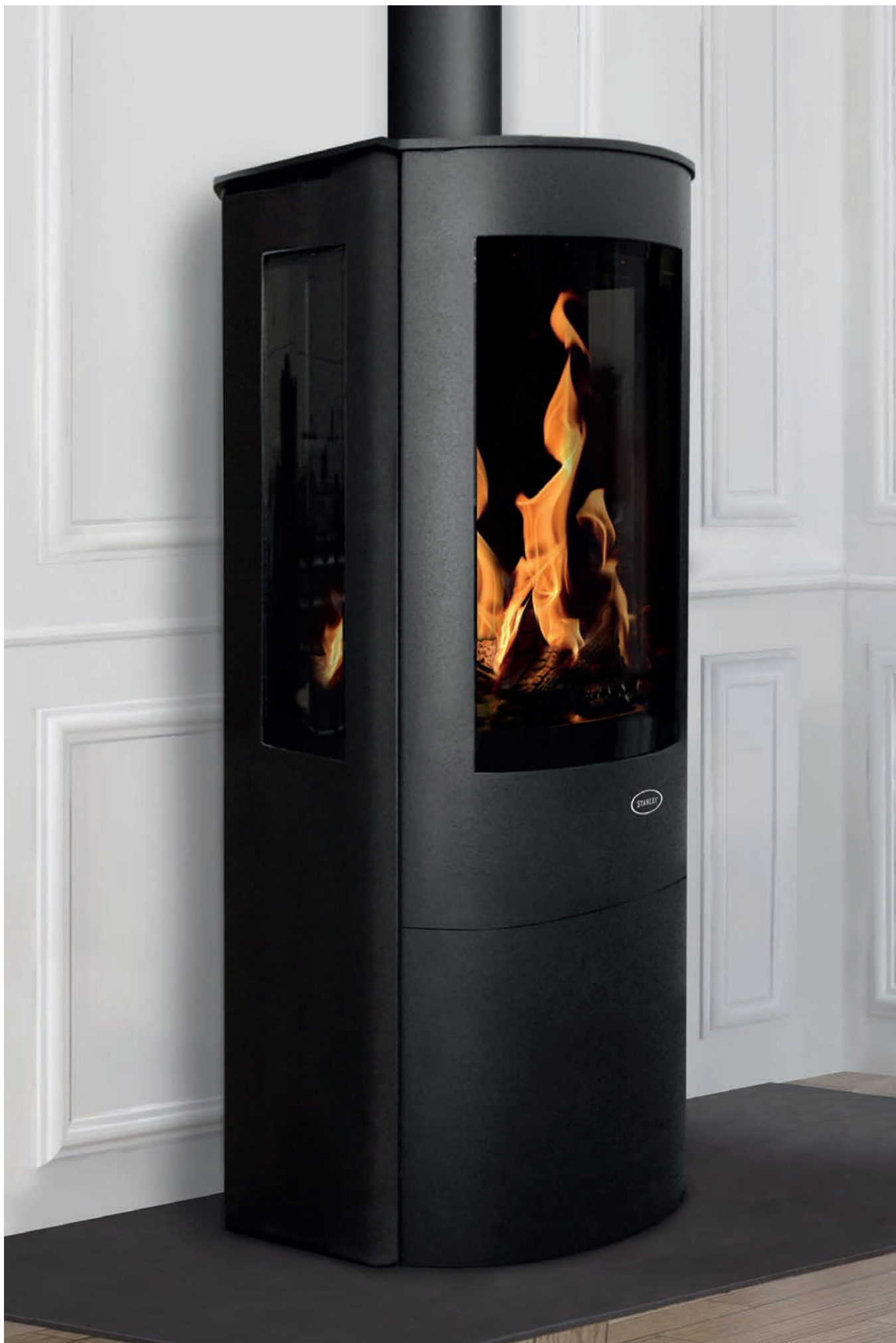
ARGON F500 Slim Gas shown